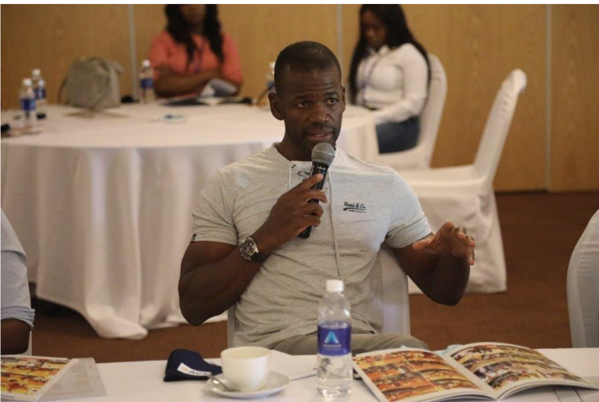
"There is no sphere of human thought in which it is easier to show superficial cleverness and the appearance of superior wisdom than discussing questions of currency and exchange"- Sir Winston Churchill