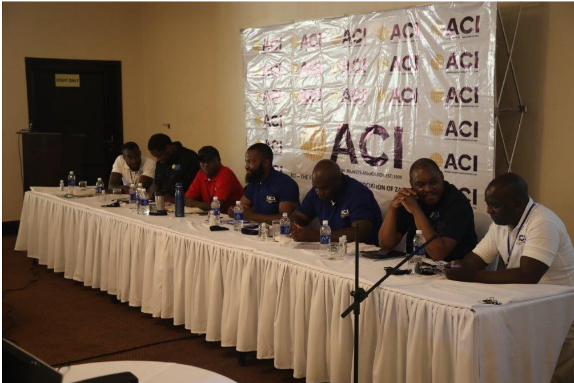
ACI Exco at the AGM

Story of the 2020 AGM told through pictures ©