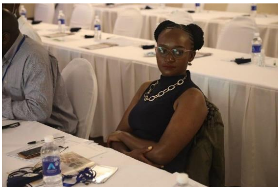
ACI Member from FNB